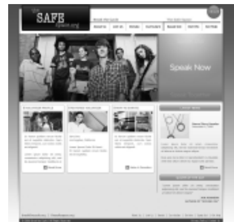
Break the Cycle launches interactive website, TheSafeSpace.org