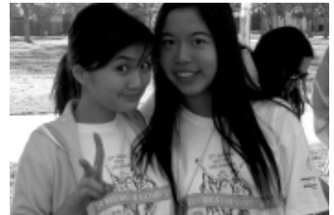
Youth Voices members volunteer at Los Angeles Run/Walk 2006