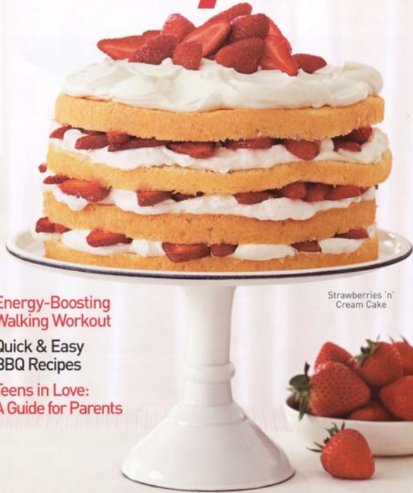
Strawberries 'n' Cream Cake

FAMILY CIRCLE is a trademark of Time Warner Entertainment Company, L.P. JUNE 2007 www.familycircle.com