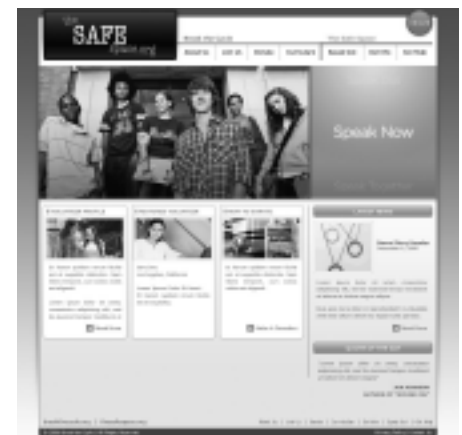
Break the Cycle launches interactive website, TheSafeSpace.org