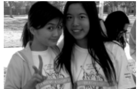
Youth Voices members volunteer at Los Angeles Run/Walk 2006