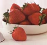
Strawberries 'n' Cream Cake

Energy-Boosting Walking Workout Quick & Easy BBQ Recipes Teens in Love: A Guide for Parents